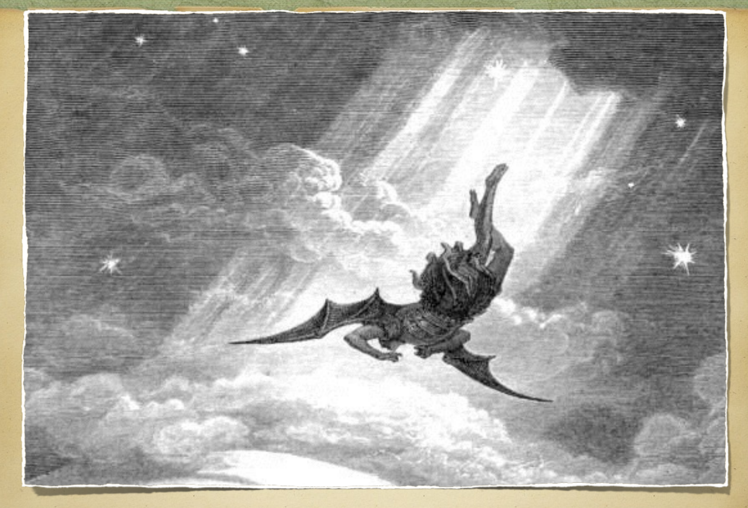
The Fall Of Satan